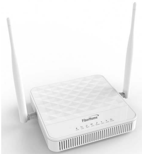
Figure 2-20 Overall Look of the AN5506-02-FG

The overall look of the AN5506-02-FG is shown in Figure 2-20.