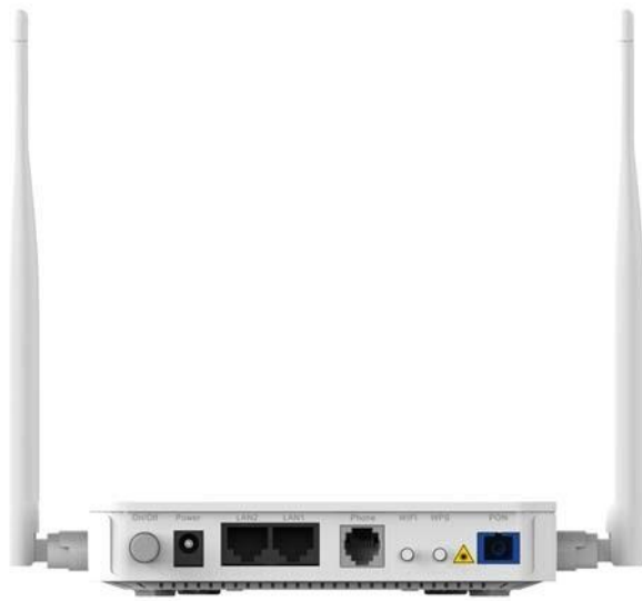
Figure 2-21 Rear Panel of the AN5506-02-FG